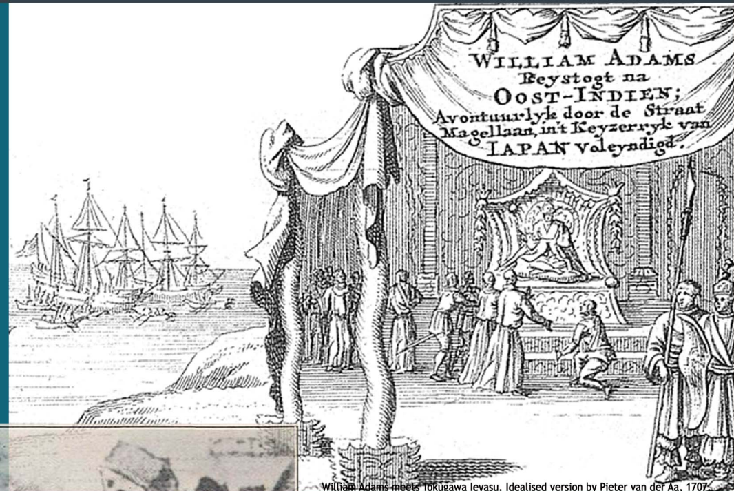
William Adams meets Tokugawa Ieyasu. Idealised version by Pieter van der Aa, 1707.