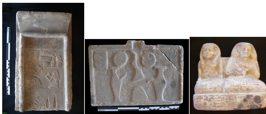
Fig.4: Elements of the 'altar' shown above and also a couple figurine that was found in association (Tavares, Kamel 2011, 13-14).