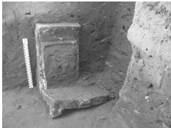
Fig.3: Set of stela and an offerings table from a house at Kom el-Fakhry (Tavares, Kamel 2011, 6).

The Kom el-Fakhry altar, as I prefer to call it, comprises a stela and an offering table arranged together (Fig. 3). The stela had three levels of decoration: the first shows an offering table, the second a seated couple both holding a lotus, and the third has a female kneeling, with a lotus in her hand, in front of a little offering table. This level was probably a late addition. The offering table was rectangular with a small furrow to drain the liquids. It was decorated in high-relief with two tall jars, breads and the leg of an animal. Next to this set was also found a small statue of a man and a woman (Fig. 4), most likely Nyka and Sta-Hathor, the couple represented in the stela, and two fragments of a statue of a dwarf (similar to those found at Lahun) probably used as a stand or to burn incense (Tavares, Kamel 2011, 6; 2012:6).