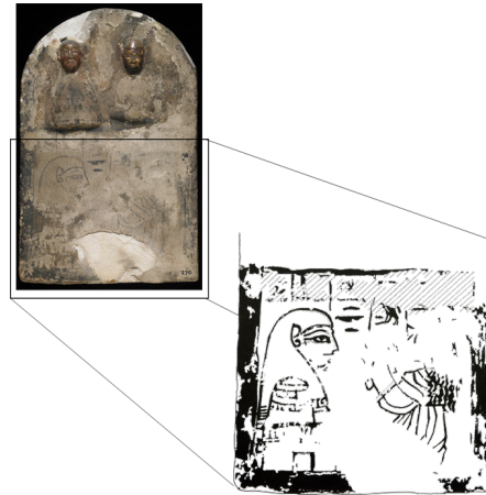
Fig.7: Stela associated with the ancestors' worship. The upper level represents, in relief, two busts, and the lower level shows a woman making offerings to a bust. © Trustees of the British Museum (BM 170).

Regarding the way these busts were used, we know, thanks to the fact that one of them was found next to a niche in a Deir el-Medina home (Friedman 1985, 83; Exell 2008, 1), and two stelae – one found by Mariette in funerary context at Abydos (Fig. 6) and another of unknown provenance (Fig. 7) currently in the British Museum (BM 170 - Mota 2015, 219, Figs. 244 and 319), – that they would be placed in the niches identified in homes or on altars in the form of pedestals.