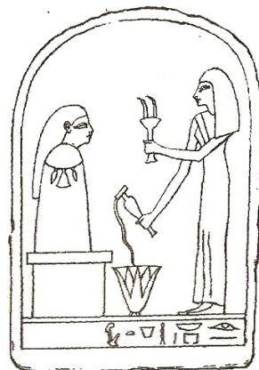
Fig.6: Representation of stela with a female figure worshipping an ancestor bust (Abydos - necropolis) In A. Mariette. 1880. Abydos: description des fouilles (band 2): Temple de Sêti. Temple de Ramsès. Temple d'Osiris. Petit temple de l'Ouest. Nécropole. Paris: Pl. 60.

As to who these busts represent, current research indicates the possibility – based on the scant inscriptions and iconography – that they were mainly women: "(...) l'immense majorité des bustes à perruque tripartite devaient représenter des êtres féminins, peut-être des ancêtres féminins spécifiquement attachés à la protection de la famille et de la procréation." (Keith-Bennett 2011, 96) So, the busts are essentially female figurines as opposed to Akh iqer stelae that were mainly devoted to men (Keith-Bennett 2011, 96; Harrington 2005, 74 and 78).