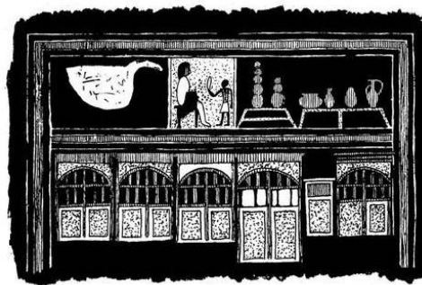
Fig.2: Parietal decoration of a house of Lahun (Petrie 1891, Pl. XVI.6).

At Lahun, another settlement in the Fayum region, we have a different kind of source: a decoration. Petrie (1891, 7, Pl.XVI-6), found the oldest known domestic decoration with a potential religious motivation (Quirke 2005, 85-6). And all points out to a representation of ancestor worship. It is a parietal polychromatic painting representing an offering scene. The composition is complex, with different elements. The emphasis lies on two human figures in the centre of the first level of the image. One figure is bigger and is sitting, the other one is smaller and is standing in front of the first one. The seated figure is receiving offerings placed on a table in front of him (Fig. 2).