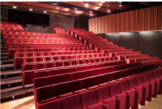
Main Auditorium, Orient Museum