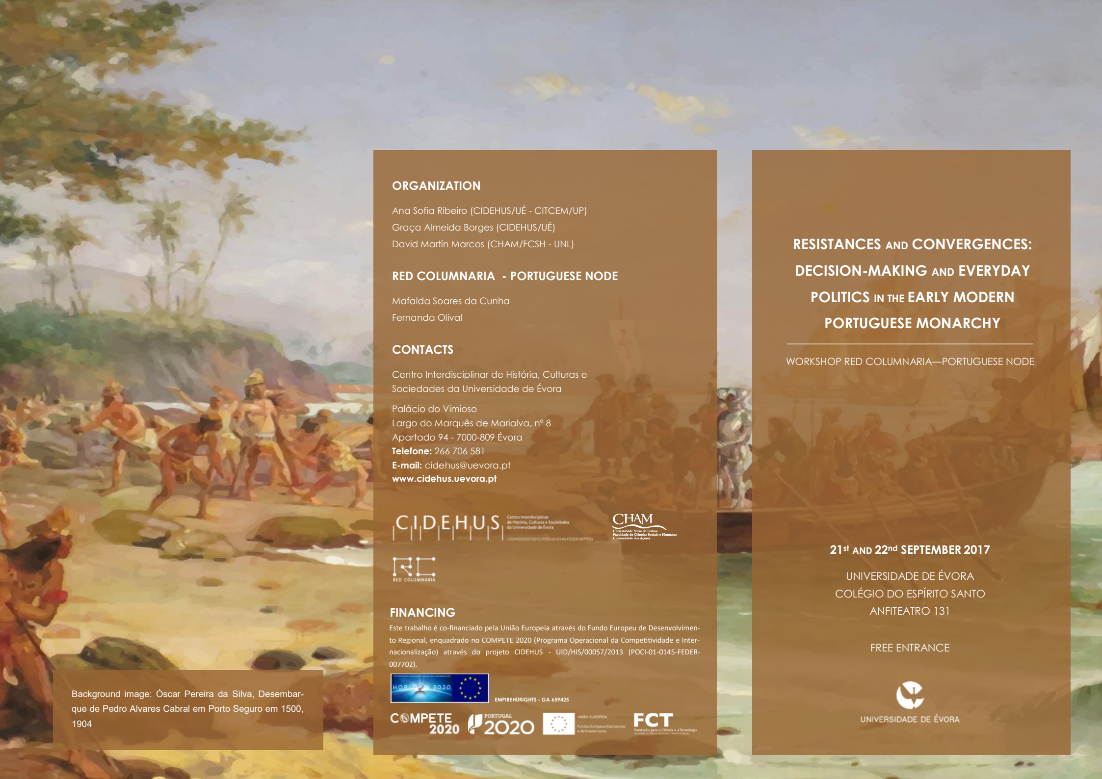
Background image: Óscar Pereira da Silva, Desembarque de Pedro Alvares Cabral em Porto Seguro em 1500, 1904